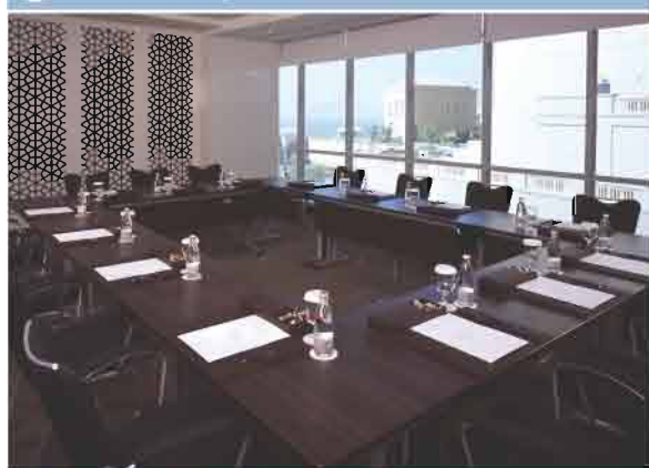
3 Ardh Meeting Room