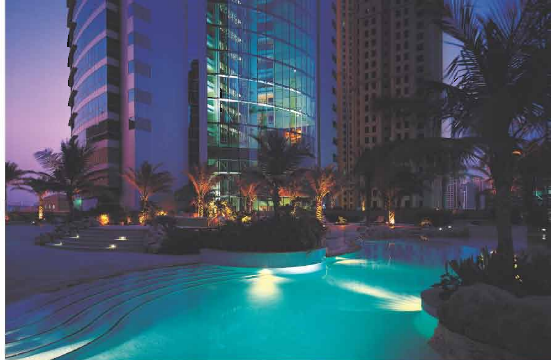
The pool at Oasis Beach Tower