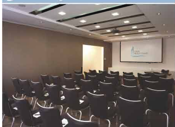
4 Nar Meeting Room