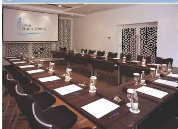
5 Maa Meeting Room