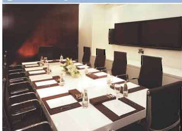
2 Reeh Meeting Room