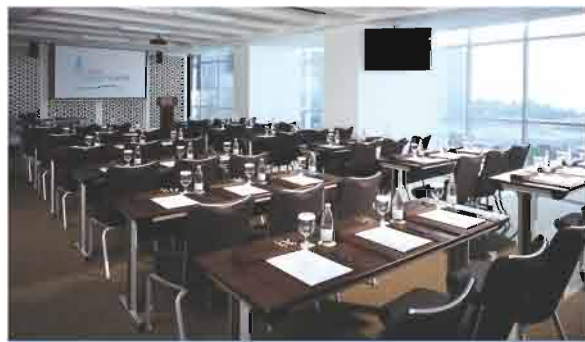
1 Hawa Meeting Room