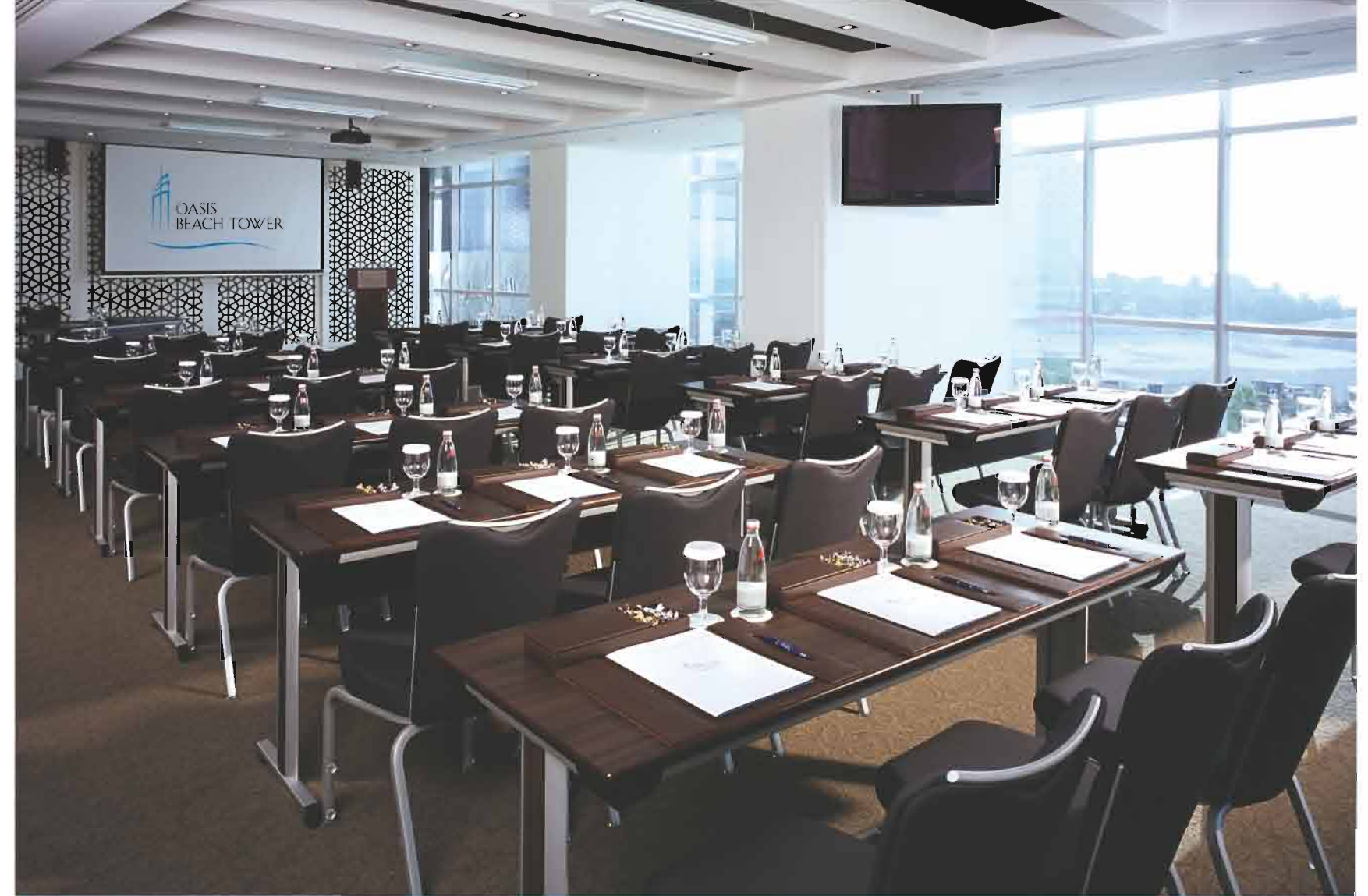
Hawa Meeting Room