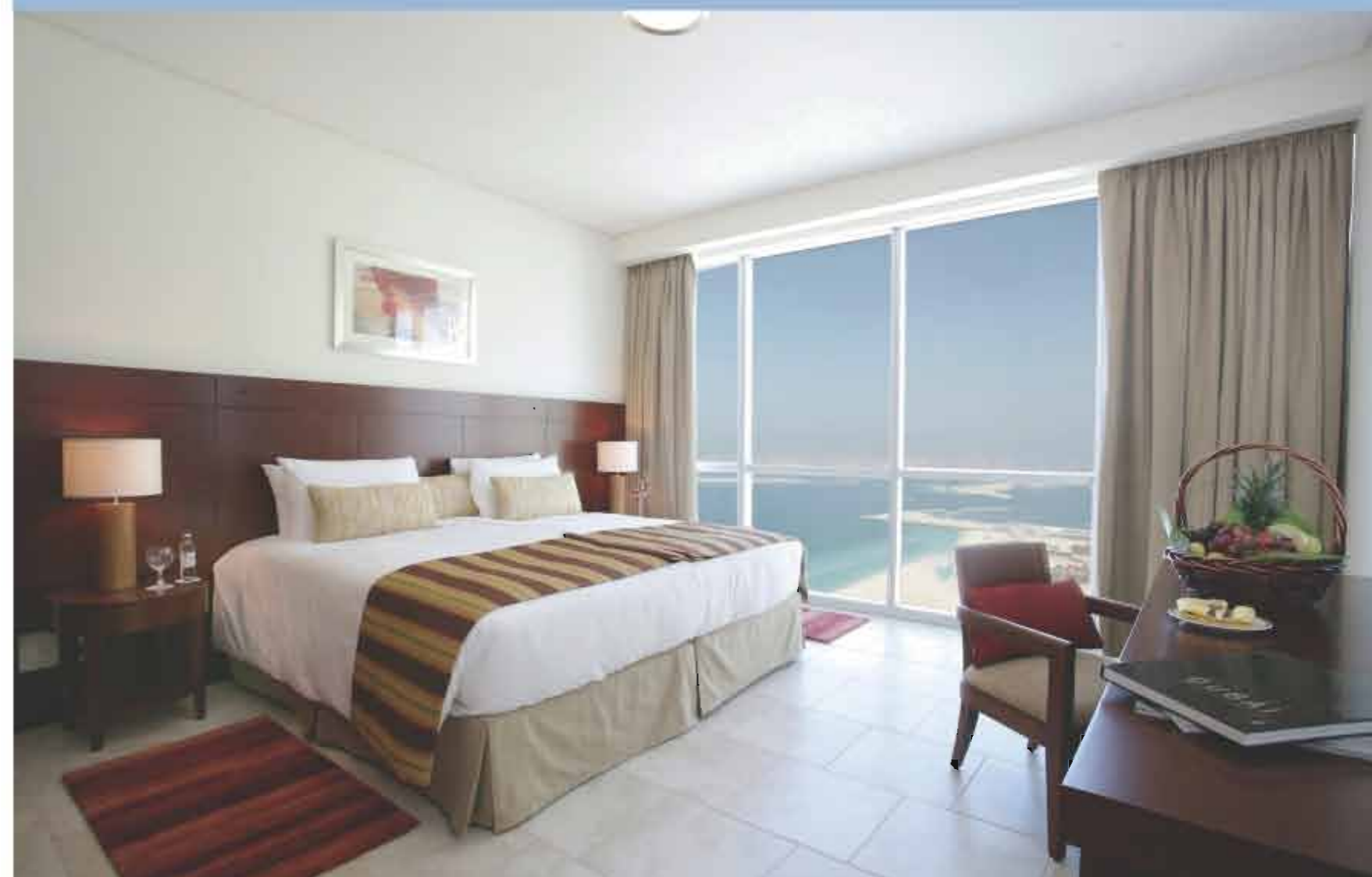
Bedroom at Oasis Beach Tower